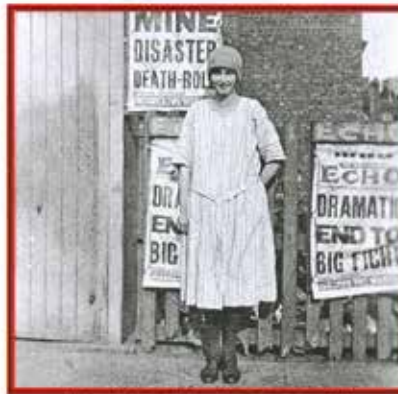
(Unknown lady on the platform of Hetton Station, circa 1920)