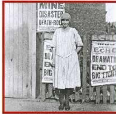
(Unknown lady on the platform of Hetton Station, circa 1920)