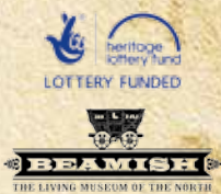
The Hetton Town Courier is produced through a partnership between Hetton Town Council and Imagine Creative Solutions. For details go to www.imaginecreativesolutions.co.uk or call (0191) 447 1016.

For more information about Hetton Silver Band Hall and the opening celebrations, visit website www.beamish.org.uk